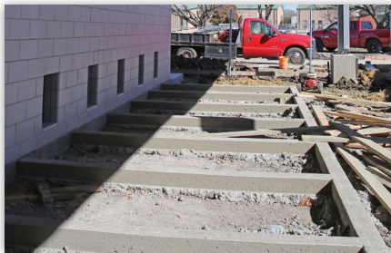
The Beginnings of the Kennels

We would also like to thank everyone who donated to create this wonderful new addition to our campus, as well as everyone who so generously contributed to the equipping of our on-site veterinary medical room. Security remains an ongoing concern, so funding for a security camera system to enable us to provide an added measure of after-hours protection for the dogs is now at the top of our wish list. Enjoy the tour!