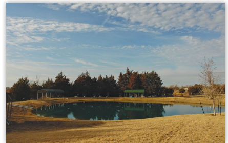
...Pond and View