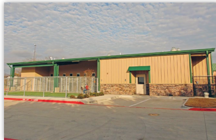
The New Front Entrance...