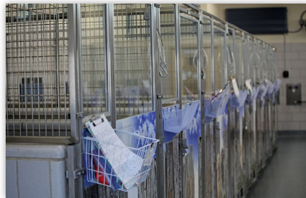
General Population Kennels Indoors