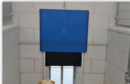
Indoor Space to Live Comfortably