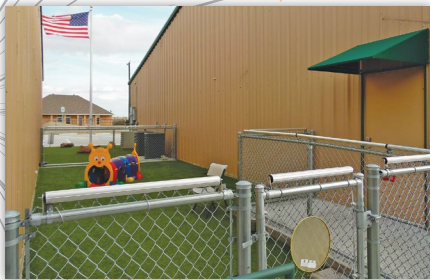
Puppy Play Yard