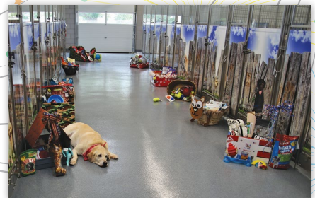
Generous Gifts from Capital One Plano!