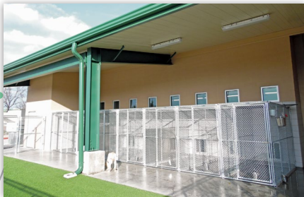
Concrete Runs Outdoors