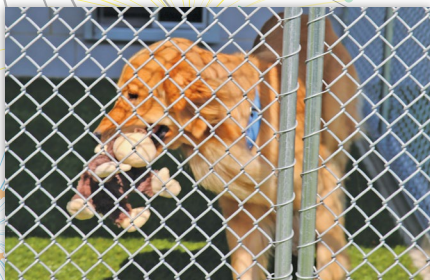
Outdoor Space to Enjoy the Sunshine