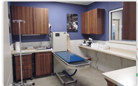
Fully Equipped Medical Room