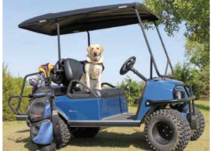
JAZZ IS READY FOR GOLF AT THE SUMMER TOURNAMENTS

Patriot PAWS would like to thank all of the hosts, sponsors and participants of these fundraisers for their generosity and support. Call our Business Development Coordinator for ideas and promotional materials for your fundraiser.